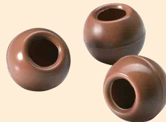
Ready for Filling Truffles