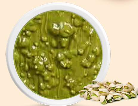
Pistachio Crunchy Cream 25%