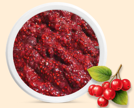
Berries with Seeds