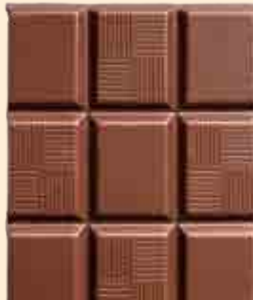
Milk Compound Chocolate