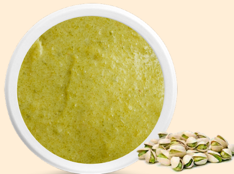
Pistachio Cream 26%