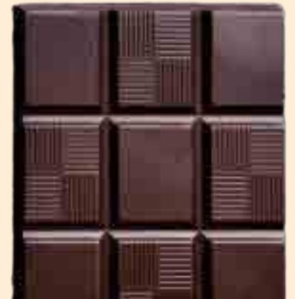
Dark Compound Chocolate