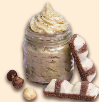
Crunchy Bueno Cream